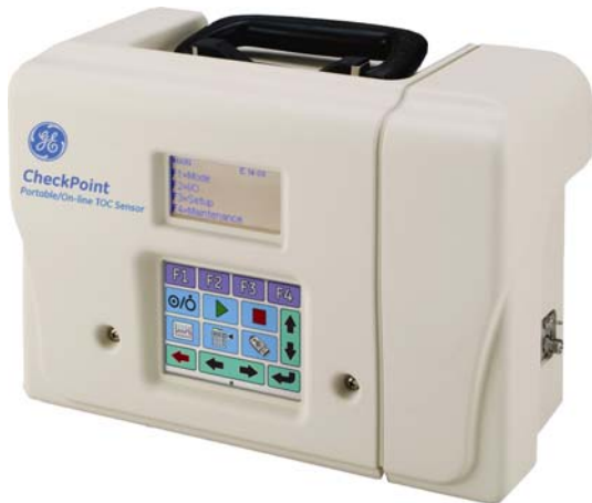
Gold Award: GE Water, Analytical Instruments' CheckPoint TOC Analyzer