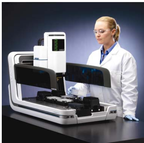
Gold Award: Hamilton's Microlab Nimbus Automatic Pipettor