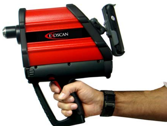
Bronze Award: A2 Technologies' Exoscan FT-IR